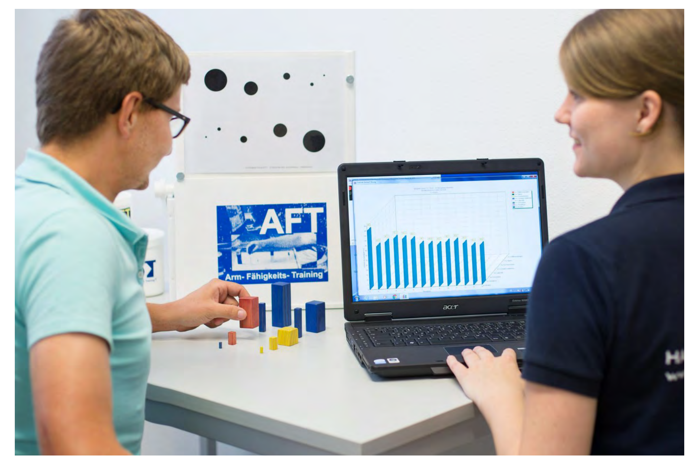
Cooperation between therapy sessions and home exercises

The app should be a tool for the actual therapy. The therapist can individually determine and adjust the exercises for each patient so that these exercises are tailored to the therapy. This is how the best possible results should be achieved.