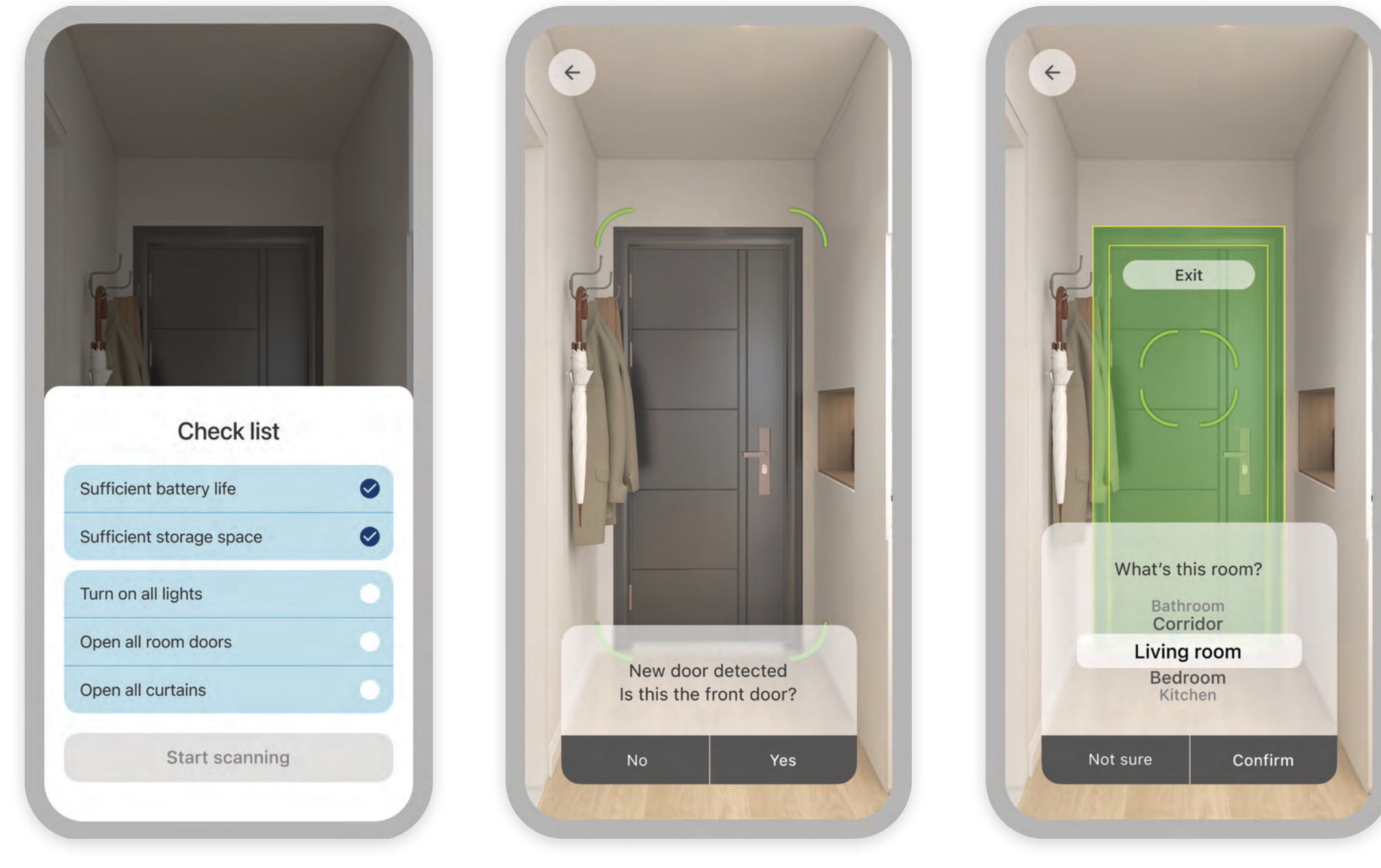
Checklist before scanning and adaptive viewfinder